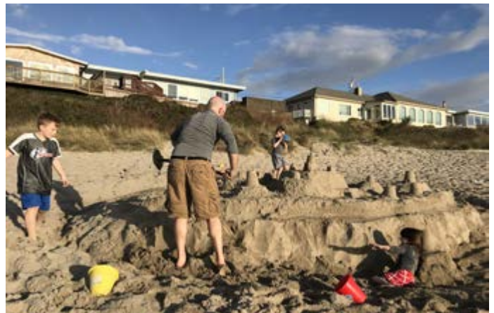
Building sand castles with the niece and nephews.