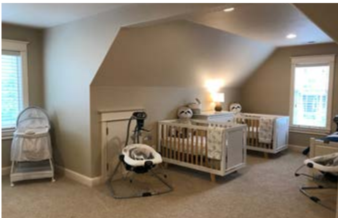
Our beautiful nursery is ready for your child - including twins!

We live in one of the highest-rated school districts in Oregon and love our neighborhood schools.