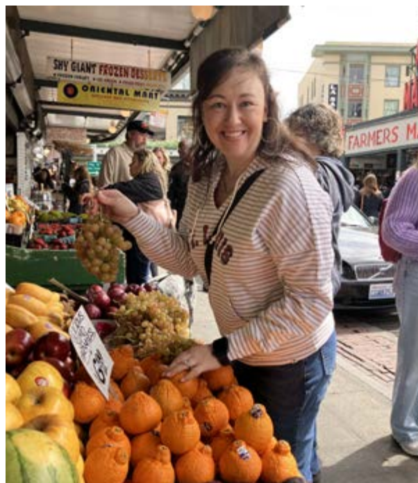
Exploring a farmer's market.