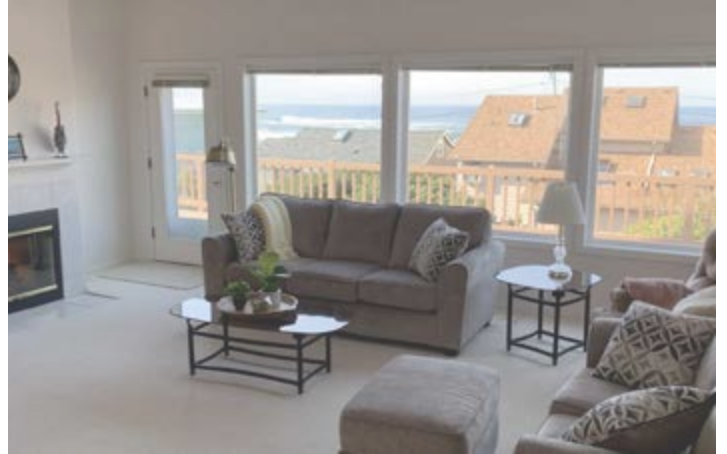
Our Oregon beach house.

We also own a vacation house on the Oregon coast, which is a little more than an hour from our home. Our house is a block from the ocean and we love watching the waves crash on the shore from our living room.