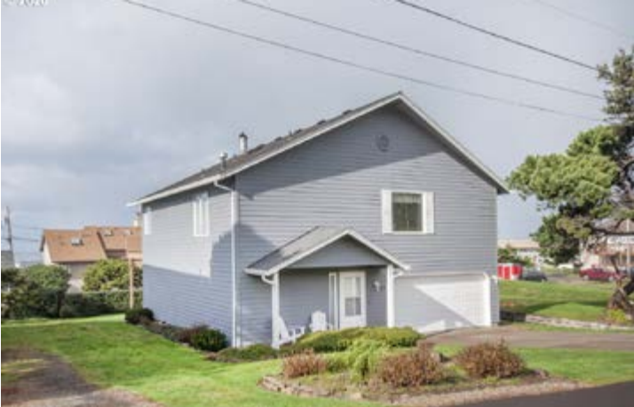
Our Oregon beach house.