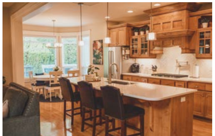
The heart of our home - the kitchen and great room.