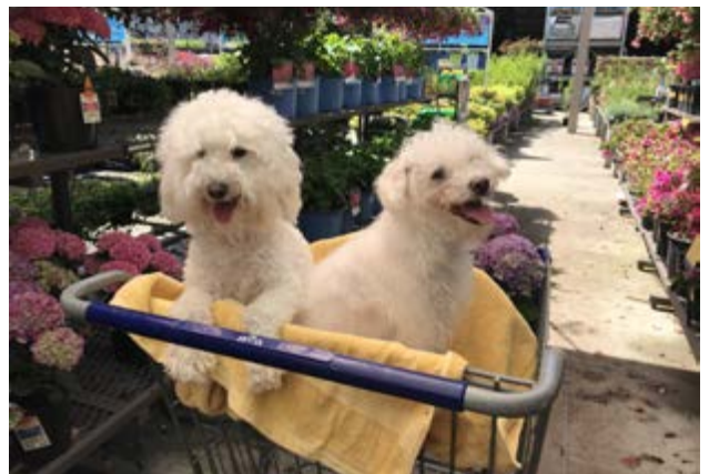
Our puppies, Chompy and Bear.